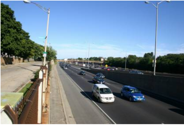
view looking east