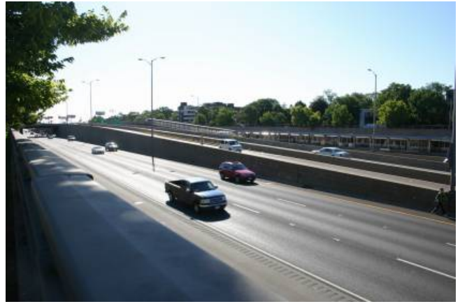
view looking west