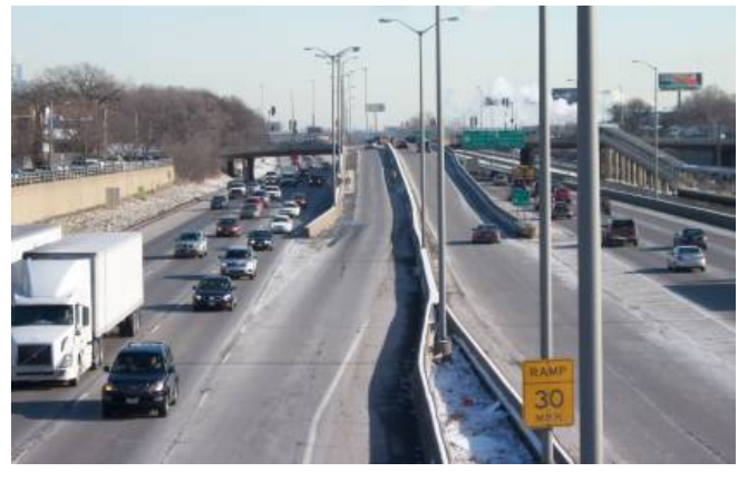
Austin Blvd exit looking east