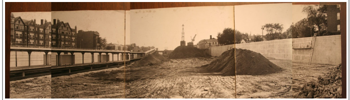
Photo taken during construction, ca. 1959-60

Lat/Long: 41.8718030835873100, -87.7896630701446800 [WGS84]