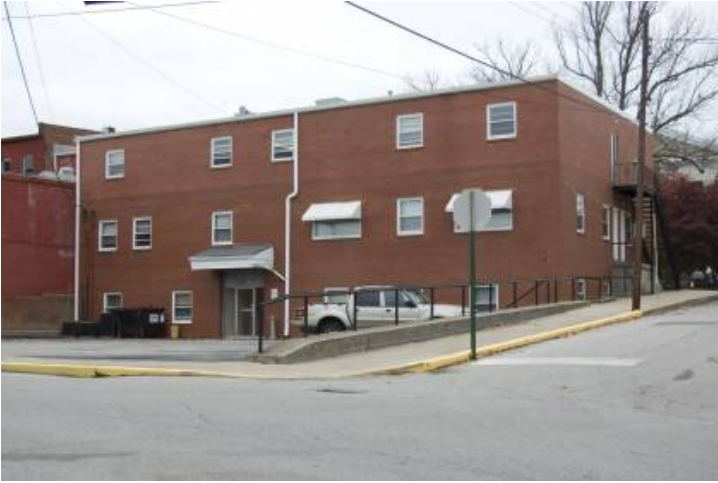
Caption: 500 Main Street rear view