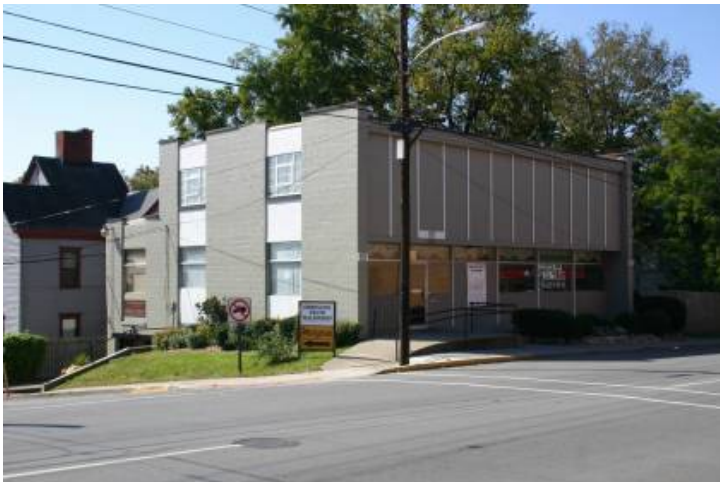
Caption: View facing SW