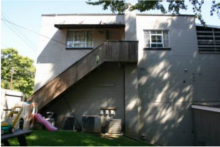
Caption: Side elevation showing wooden staircase